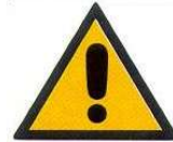
RISK OF FALLING INTO WATER